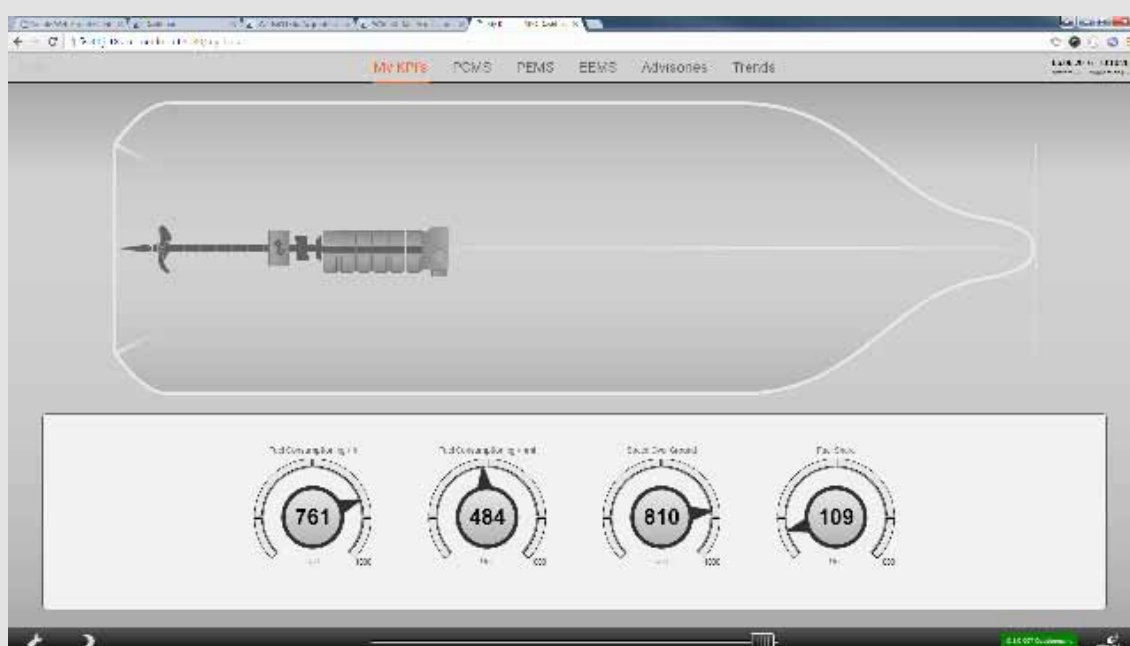
Four KPIs gauges selected on dashboard

Same data will be available at the customer's back office via internet connection, through Wärtsilä Online services.