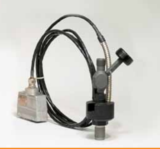
The unique cylinder pressure transducer is an integral part of the Intelligent Combustion Monitoring system which provides maintenance-free operation under MTBF of more than 10 years.