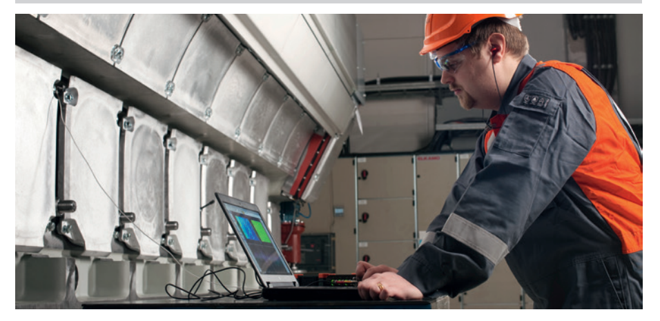
Wärtsilä's experts report the measurement and analysis results and make recommendations for improving engine performance.