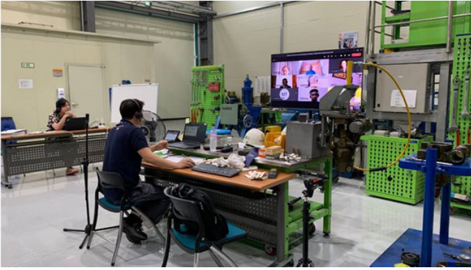
Instructors use multiple cameras to provide a world-class remote learning experience