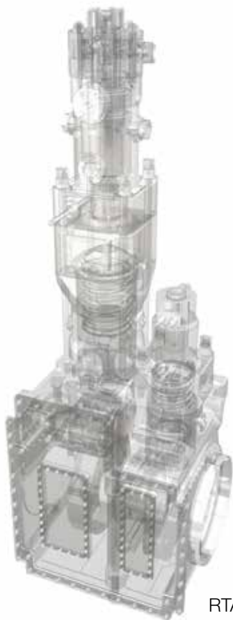
RTA fuel oil pump

Professional marine cargo transportation depends directly on the reliability and efficiency of the main engines. Core engine components, such as the fuel pumps, therefore require thorough inspection and maintenance at regular intervals. Wärtsilä offers flexible and cost-attractive overhaul packages for RTA fuel pumps.