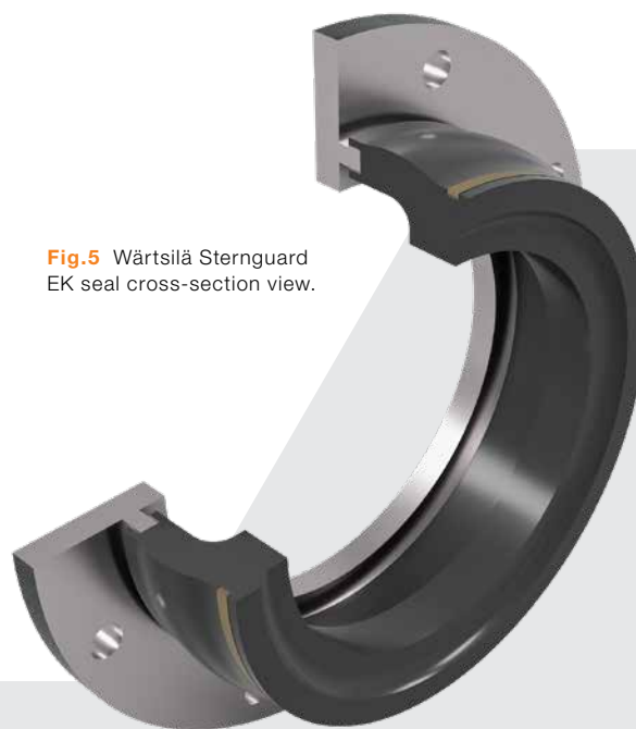
Fig.5 Wärtsilä Sternguard EK seal cross-section view.

Wärtsilä Shaft Line Solutions is an industry leader in shaft line components. We deliver a portfolio of end-to-end services and integrated solutions for the marine markets. This builds on our core values: lifecycle efficiency, risk reduction, environmental leadership and design excellence. As an original equipment manufacturer operating in 75 countries, we have the capabilities to support customers on a global scale and remain committed to providing in-country and round-the-clock expertise.