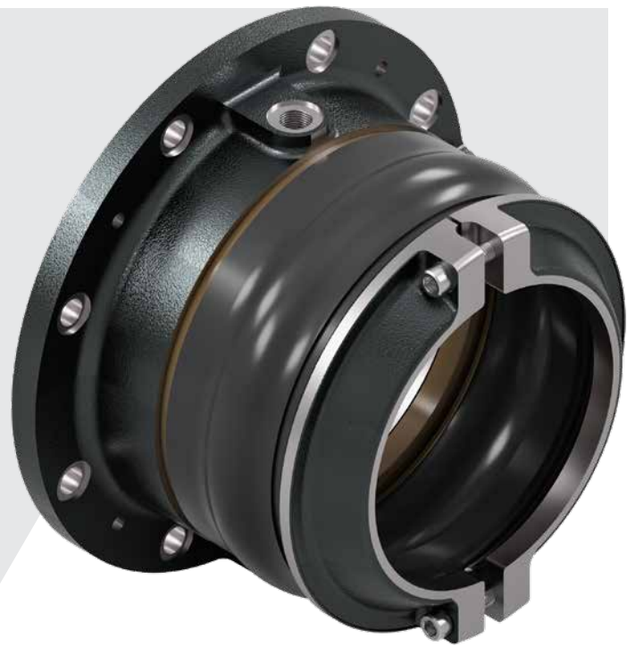
Fig.2 Wärtsilä Sternguard EL seal.

FWD solutions: the Wärtsilä Sternguard EJ and the Wärtsilä Sternguard EL. The EL face can be split and is a separate assembly from the seal body. An inflatable seal can be used on both FWD versions.