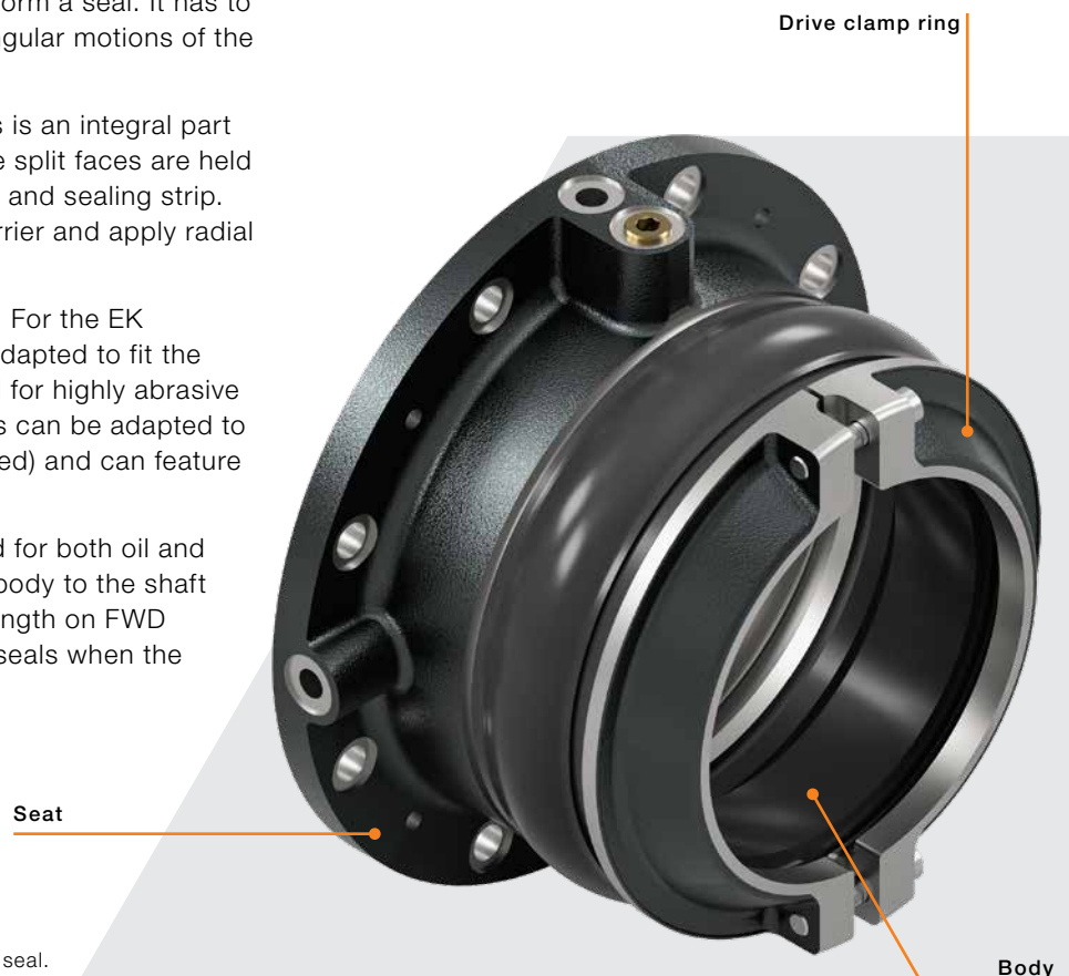
Fig.4 Wärtsilä Sternguard EJ seal.

Drive clamp ring – This can be used for both oil and water lubricated seals. It clamps the body to the shaft and keeps the design compression length on FWD seals (EJ/EL). It can be used on AFT seals when the propeller hub is not close enough.