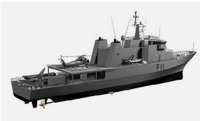
Offshore Patrol Vessel