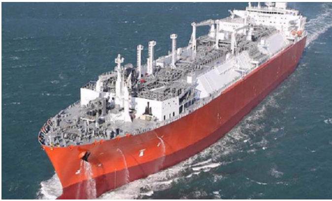
Steam Turbine LNG Carrier