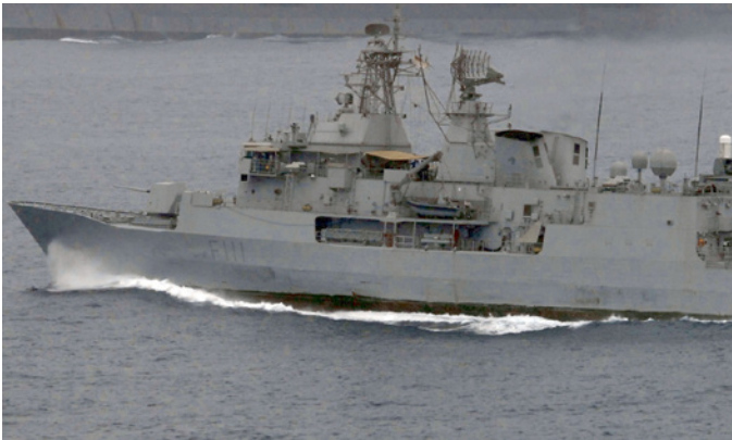
ANZAC Frigate Ship