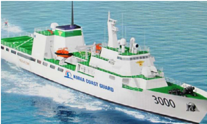
Patrol Vessel PV3000