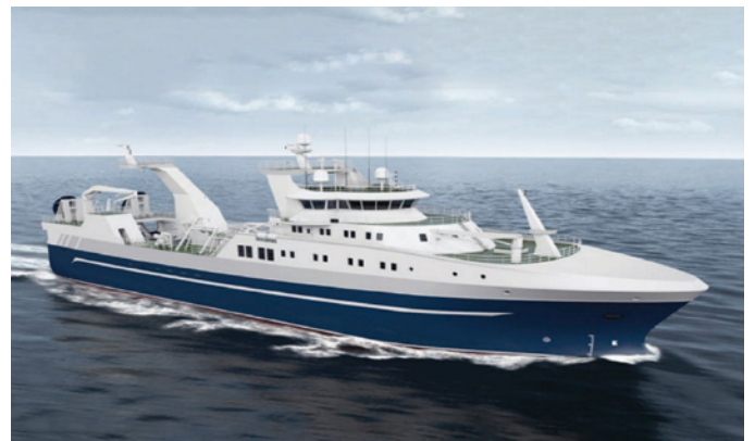
Wartsila31 Hybrid Drive