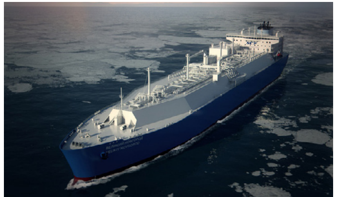
Dual Fuel Diesel-Electric LNG Carrier