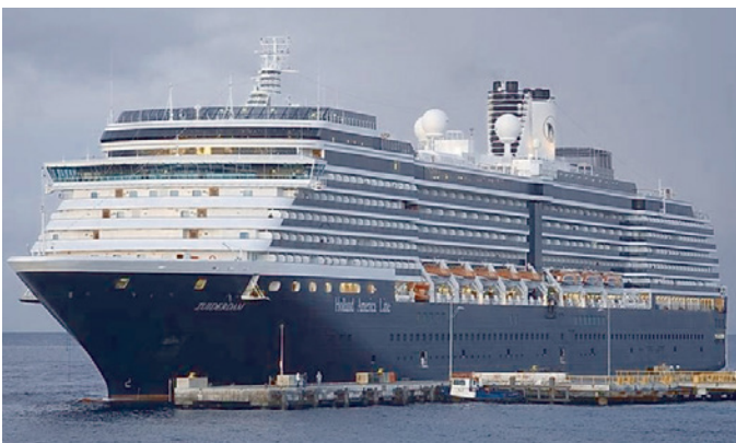
Azipod Diesel-Electric Cruise Ship