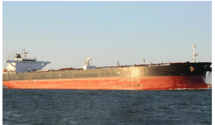
Tanker LCC (AFRAMAX)