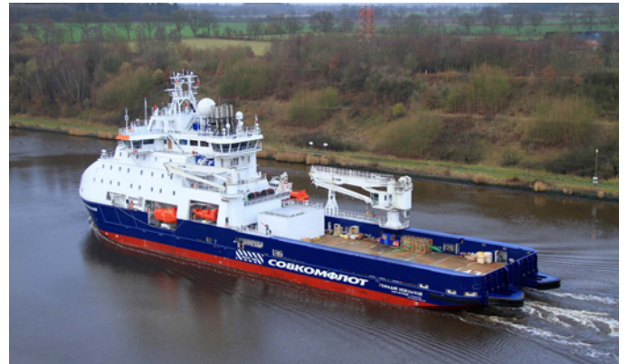
Platform Supply Vessel