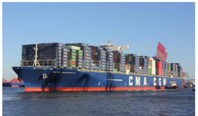
Containership—Electronic Controlled Main Engine