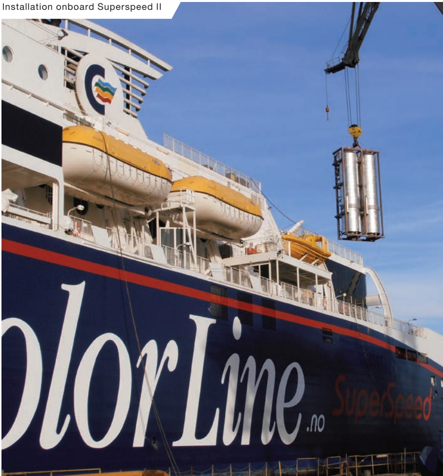
Installation onboard Superspeed II

Hybrid I-SOx scrubbers are an attractive alternative for cruise vessels with multiple engines – especially for retrofits.