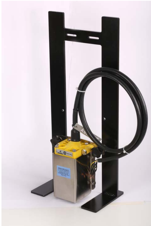
Sensor with bracket