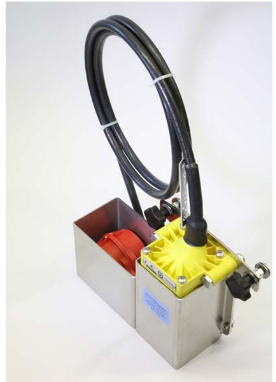
Bilge for critical applications, including bilges