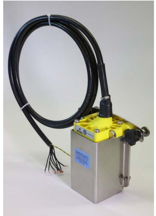
Standard for "clean" environment applications

The Smart-VS-Level is available in two types: