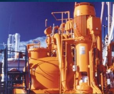
Pumps & Valves