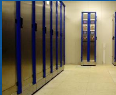
Power Electric Systems