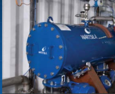
Ballast Water Management