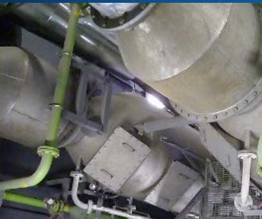
Exhaust Gas Cleaning