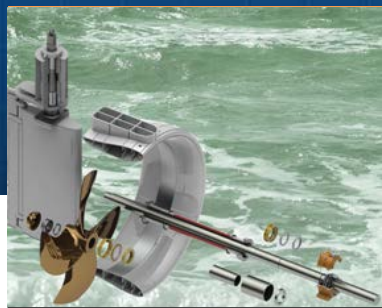
Seals, Bearings & Stem Tubes