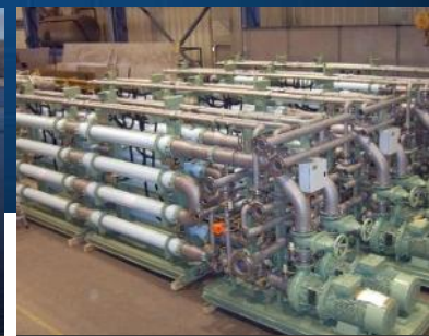
Waste & Fresh Water Management