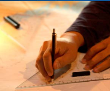
Marine Lifecycle Solutions