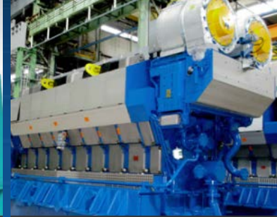
Engines & Generating Sets